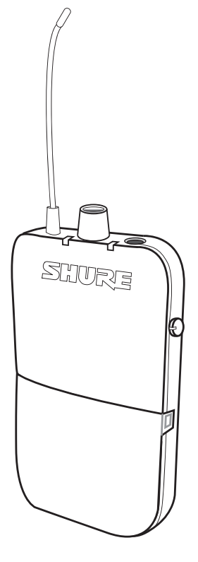
P3R Wireless Bodypack Receiver