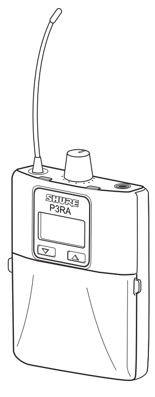
P3RA Professional Bodypack Receiver